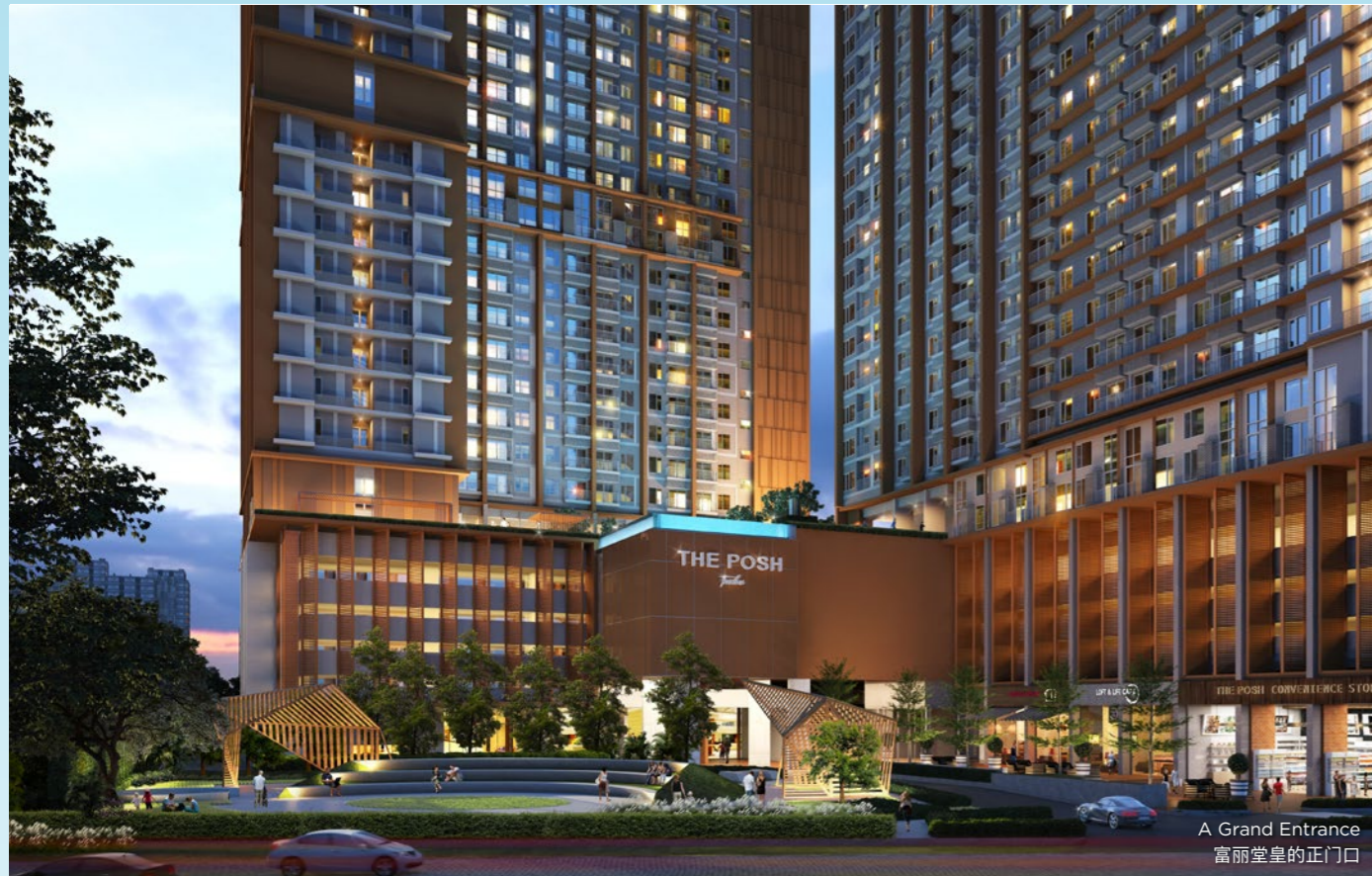
A Grand Entrance 富丽堂皇的正门口