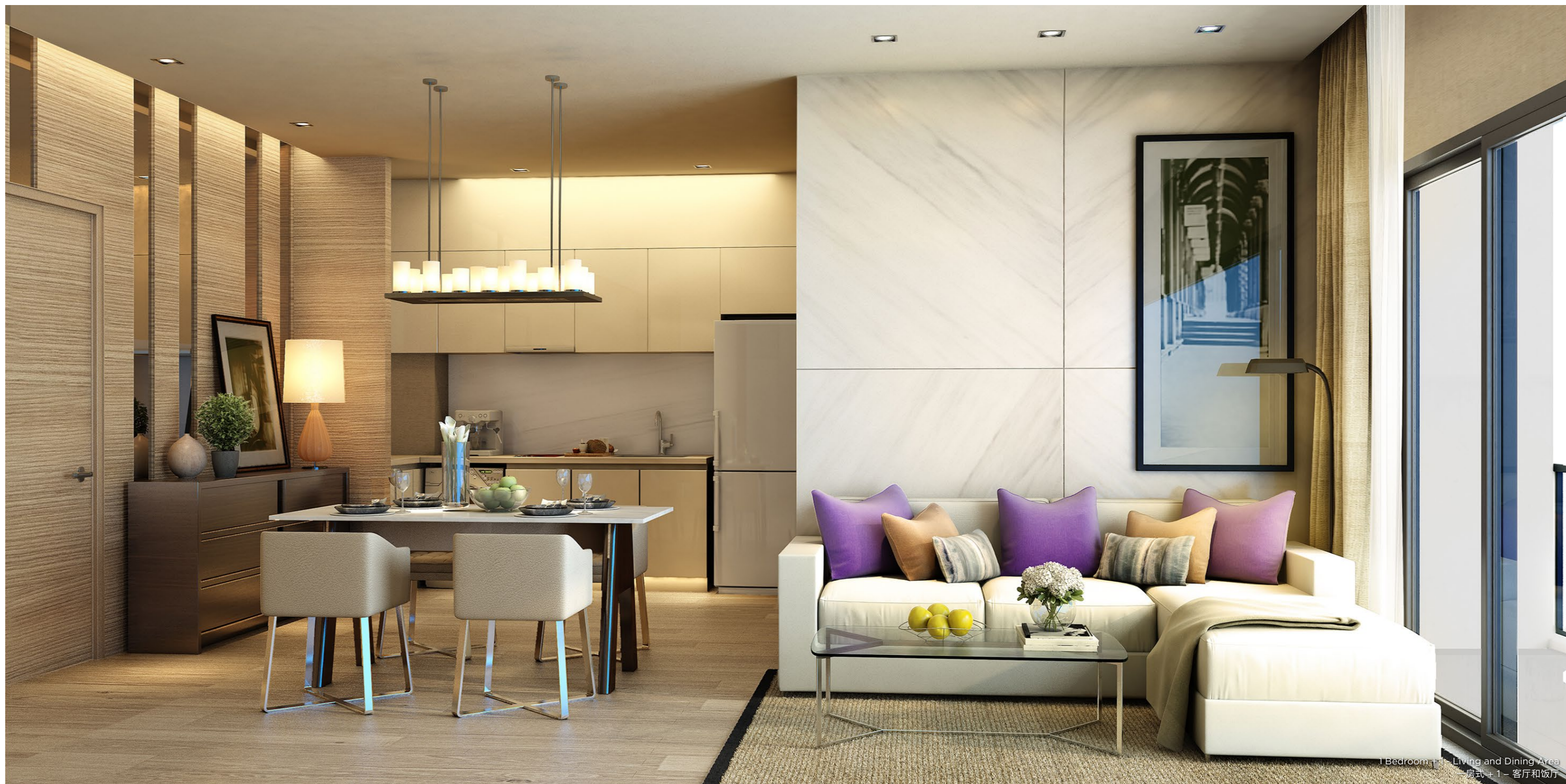
1 Bedroom - Living and Dining Area 一房式 - 1 - 客厅和饭厅