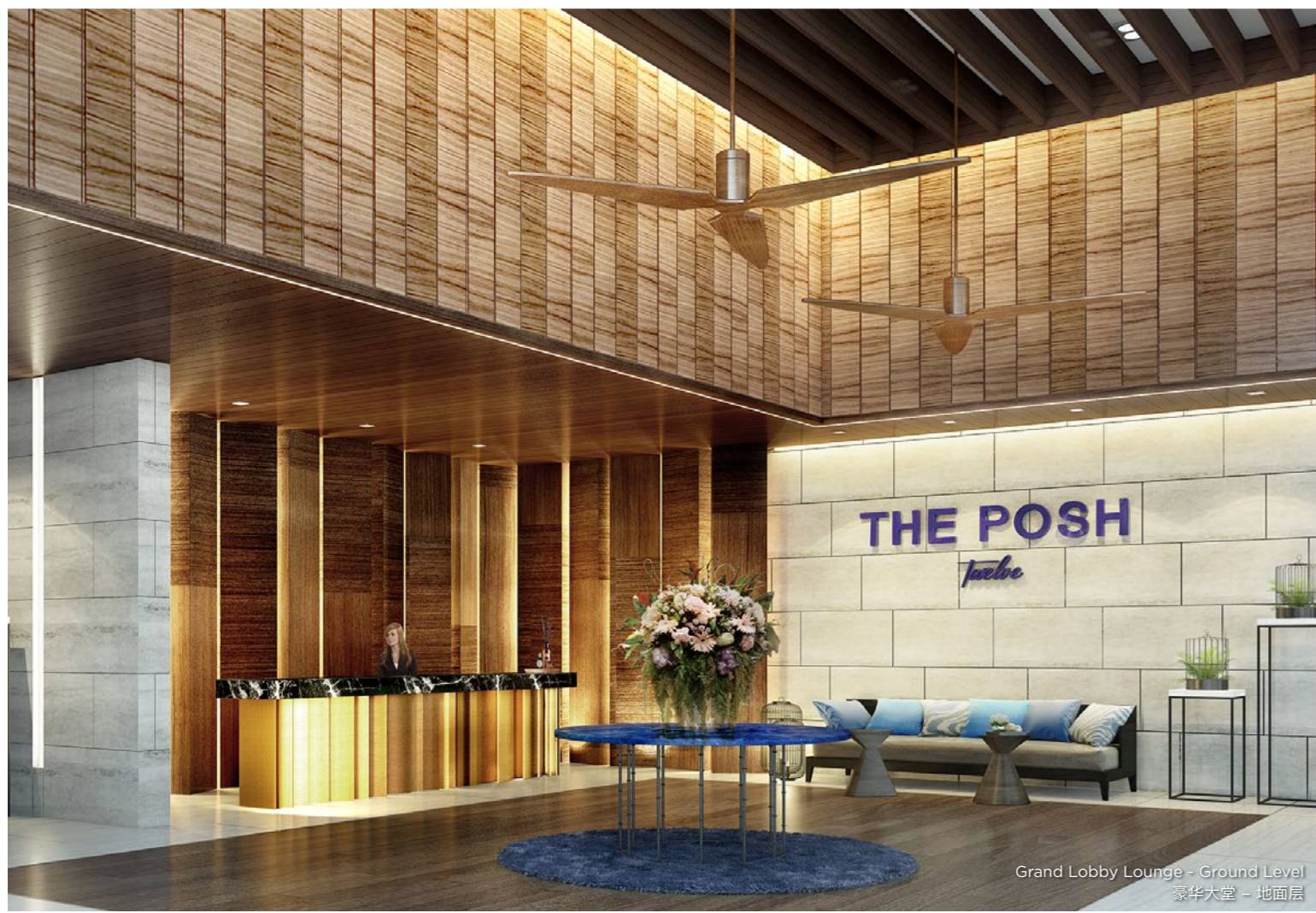
Grand Lobby Lounge - Ground Level 豪华大堂 - 地面层