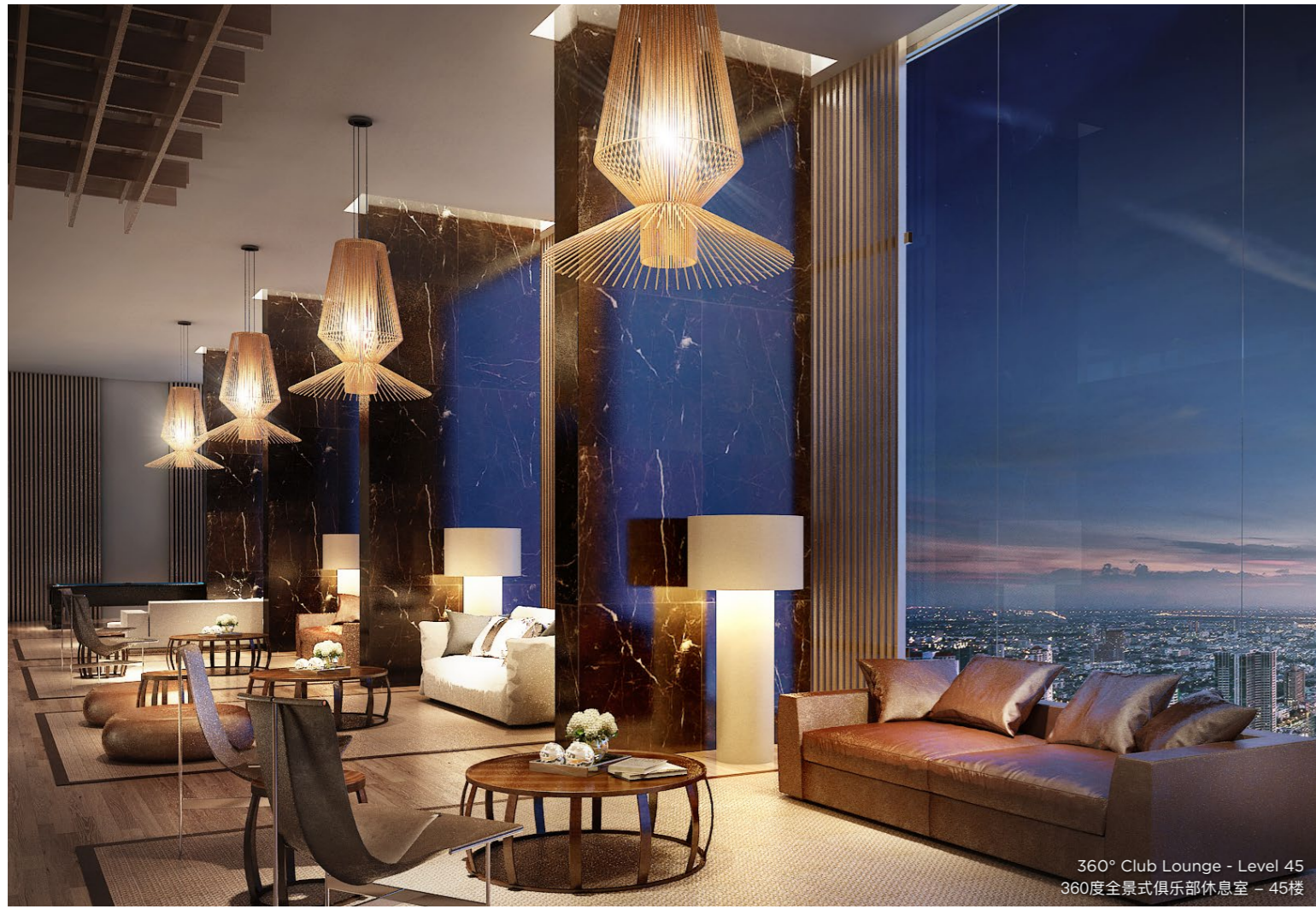
360° Club Lounge - Level 45 360度全景式俱乐部休息室 - 45楼