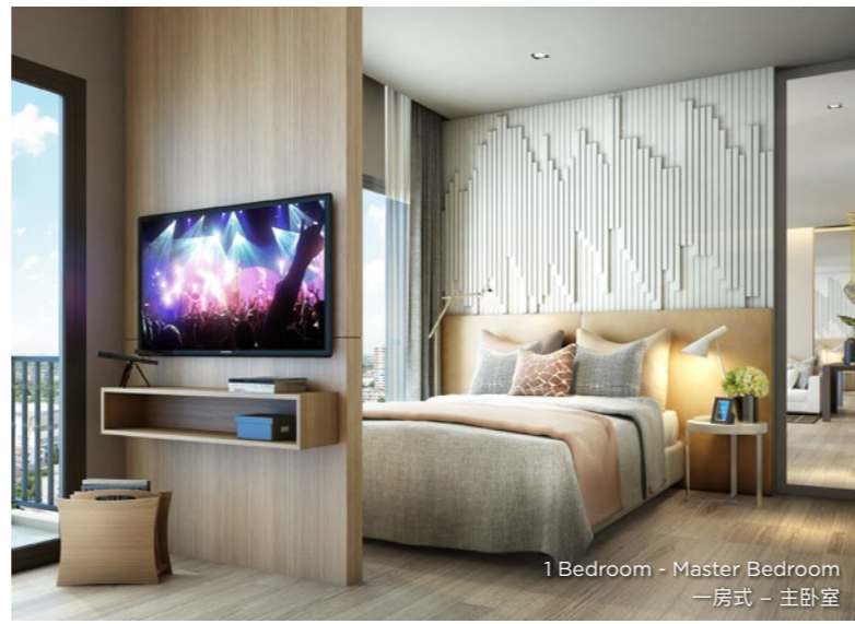
1 Bedroom - Master Bedroom 一房式 - 主卧室