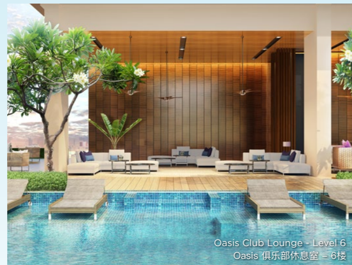
Oasis Club Lounge - Level 6 绿洲俱乐部休息室 - 6楼