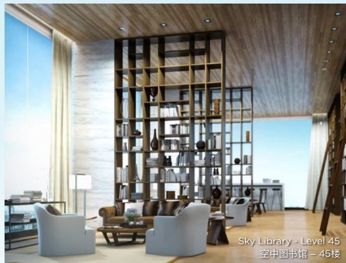
Sky Library - Level 45 空中图书馆 - 45楼