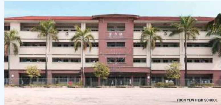
FOON YEW HIGH SCHOOL