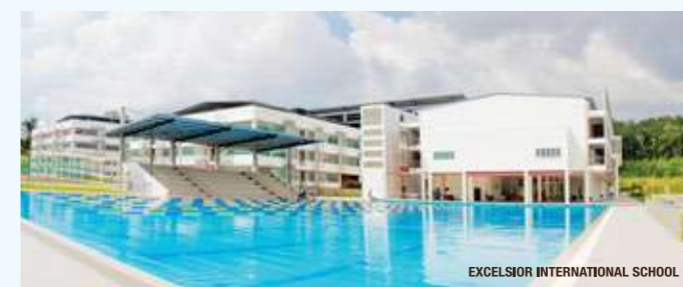
EXCELSIOR INTERNATIONAL SCHOOL

R&F Princess Cove has signed agreement with Excelsior International School managed by Raffles Education Group, a highly-acclaimed education group in Asia Pacific. The school would provide quality education from pre-school to high school which links with international education system. Premise owners of R&F Princess Cove have the priority to enroll their children here.