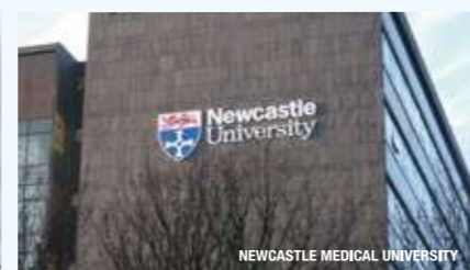
NEWCASTLE MEDICAL UNIVERSITY