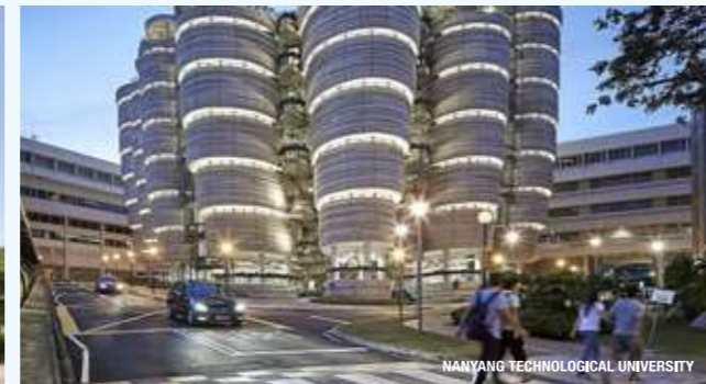
NANYANG TECHNOLOGICAL UNIVERSITY