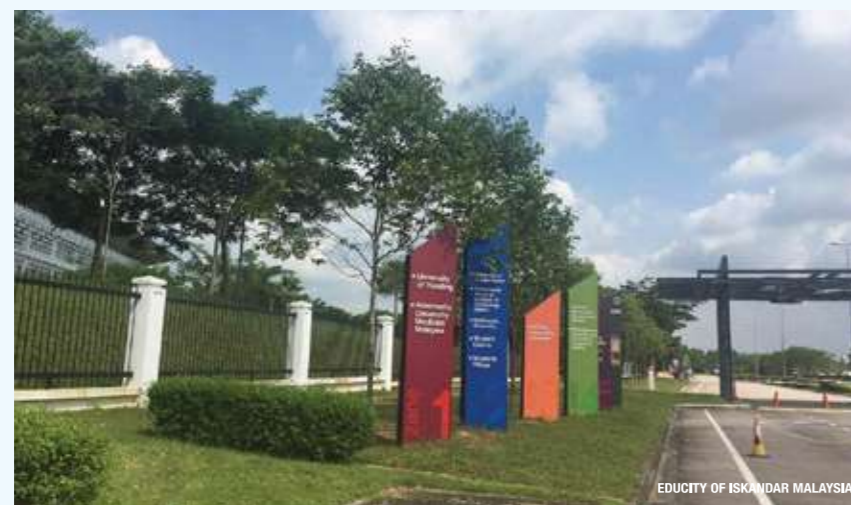
EDUCITY OF ISKANDAR MALAYSIA

R&F Princess Cove is close to Educity which hosts Newcastle Medical University, University of Southampton, University of Reading and various other branch campuses of world-acclaimed higher learning institutes which answers different academic needs.