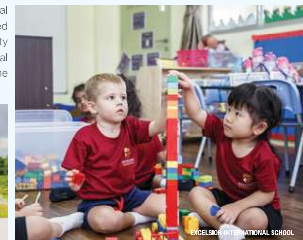
EXCELSIOR INTERNATIONAL SCHOOL