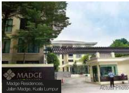
Madge Residences, Jalan Madge, Kuala Lumpur