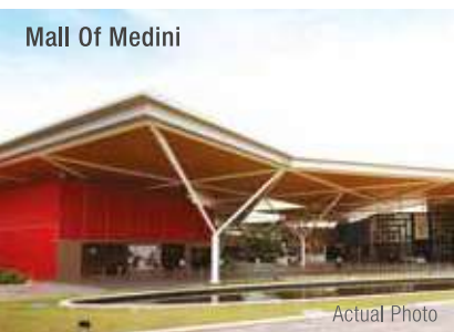
Mall Of Medini