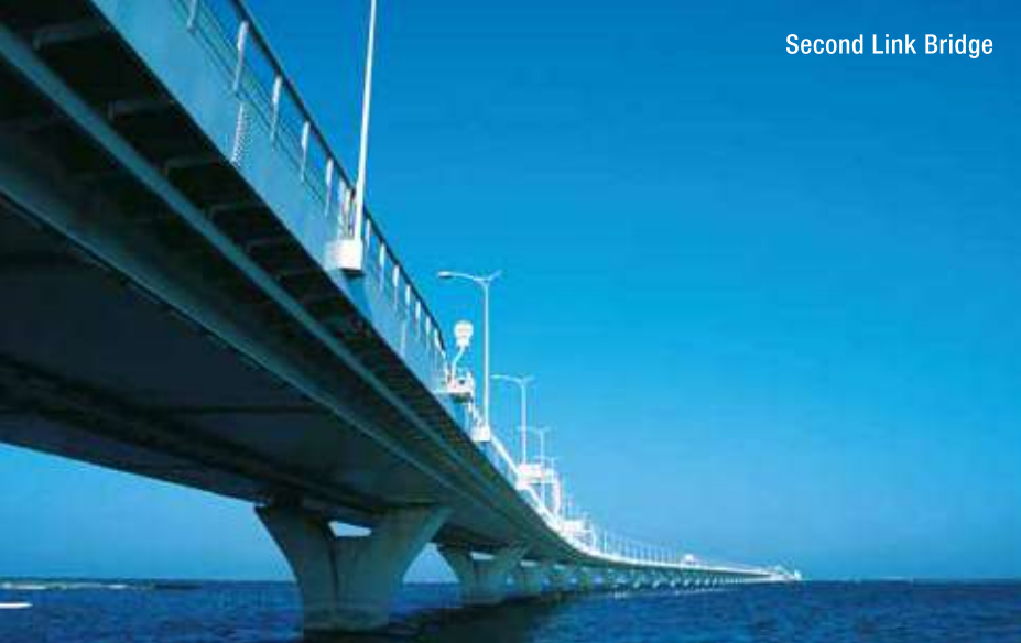
Second Link Bridge