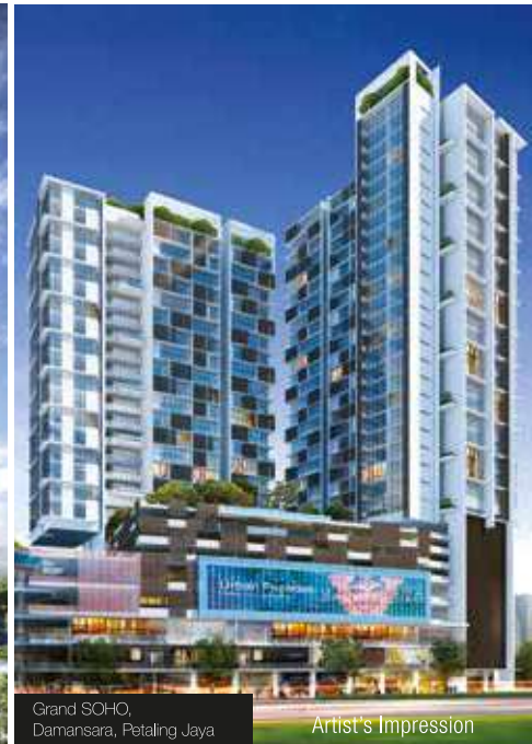
Grand SOHO, Damansara, Petaling Jaya