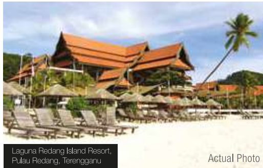
Laguna Redang Island Resort, Pulau Redang, Terengganu