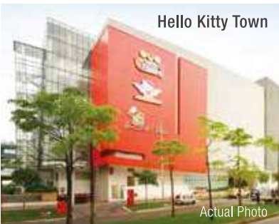
Hello Kitty Town