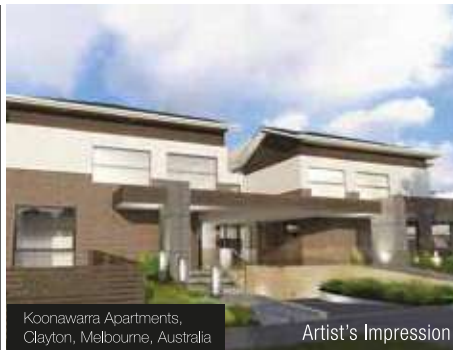
Koonawarra Apartments, Clayton, Melbourne, Australia