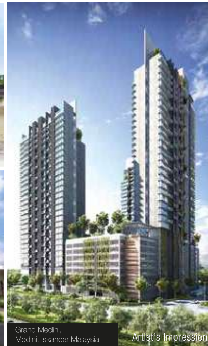
Grand Medini, Medini, Iskandar Malaysia